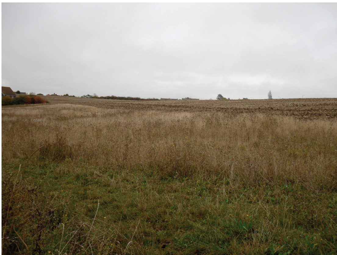
Plate 1. Topography of surviving farmland to the south and east of the proposed development area (Facing south-east).