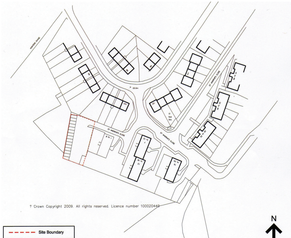
Figure 2. Location of Proposed Development