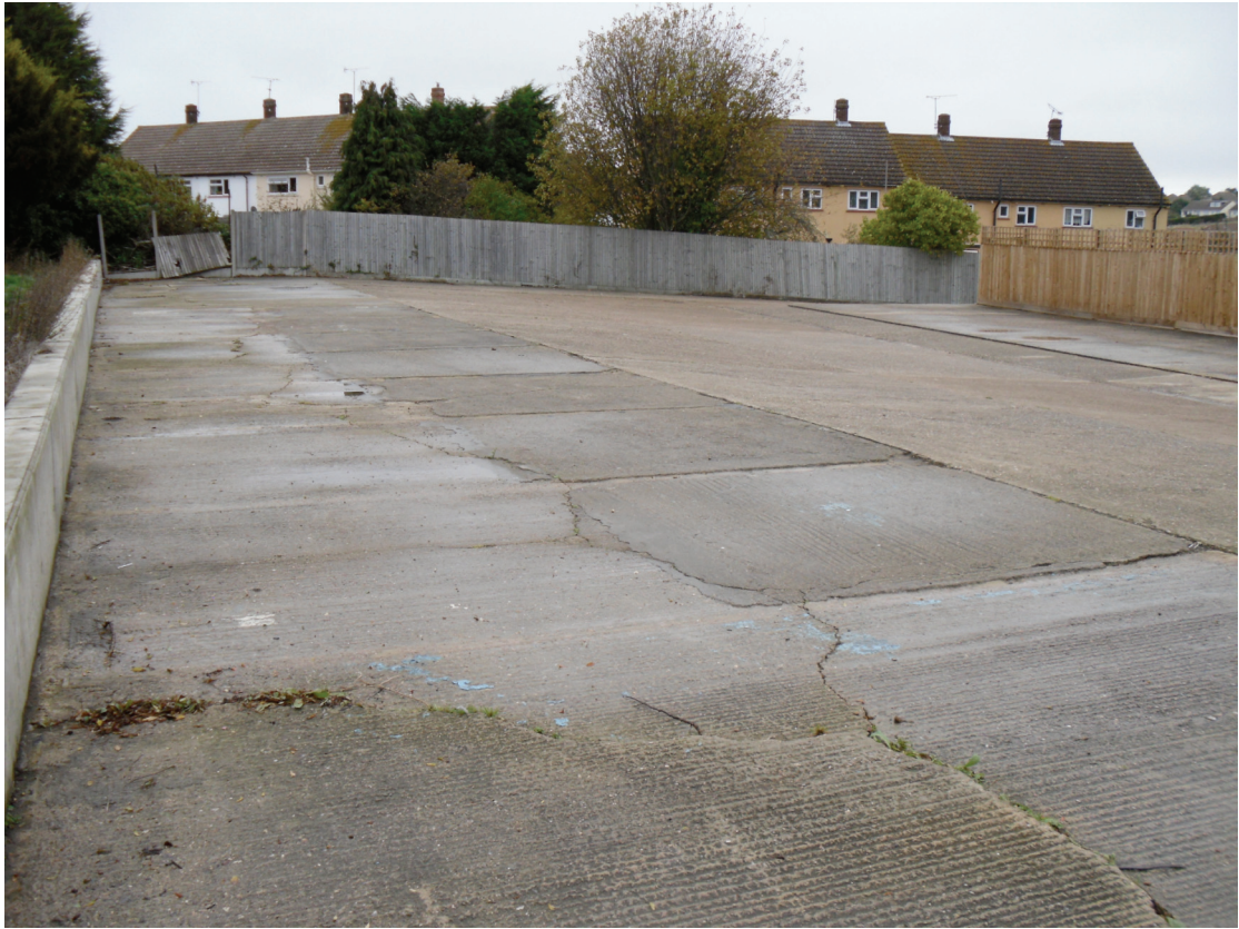
Plate 2. General view of the proposed development site (facing north-east).