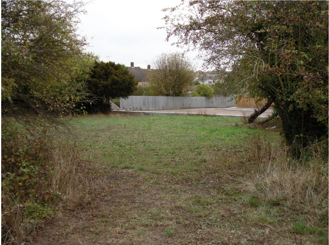
Plate 4. Detail view of the rear of the proposed development site from the boundary with Duncan Down (facing east).