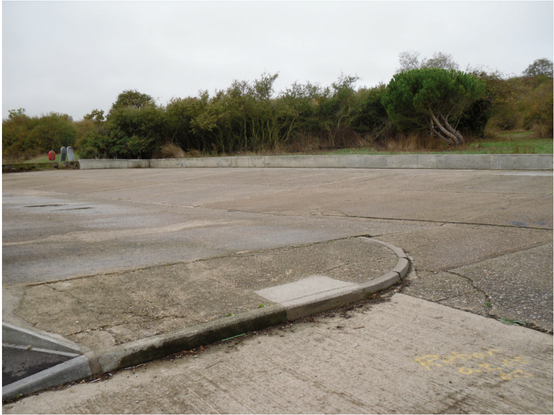
Plate 3. General view of the proposed development site and its proximity to Duncan Down from the site entrance (facing south-west).